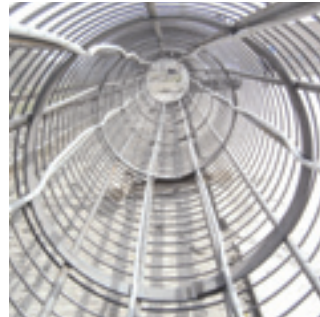
RAUGEO energy pile