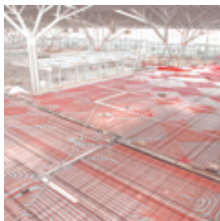
REHAU underfloor heating system