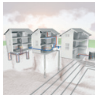
RAUGEO geothermal heat extraction system