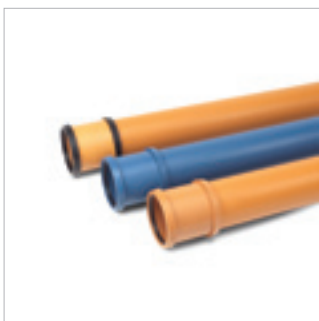
AWADUKT PP SN10 sewer pipe system